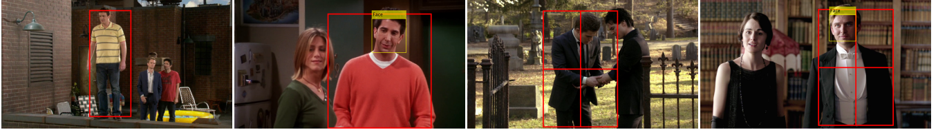
(a) 1-Level Pyramid