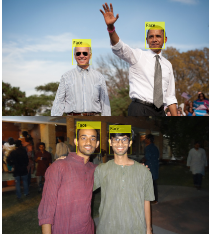
(a) Frontal Face Detections