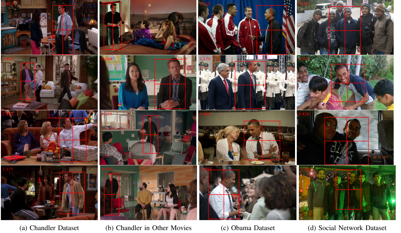
Fig. 5: Representative images for the final results of detection and localization in different datasets.