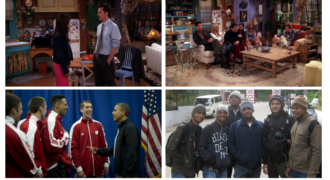
Fig. 1: Sample positive images from the datasets. Images in the top row are from TV Series Dataset, bottom left image is from Obama Dataset and last image is from Social Network Dataset.

This work was performed when Deepak Pathak was partly at IIT Kanpur.